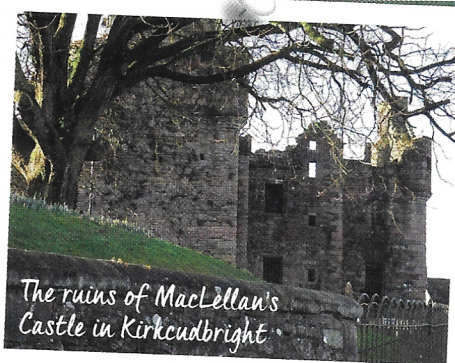
The ruins of MacLellan's Castle in Kirkcudbright