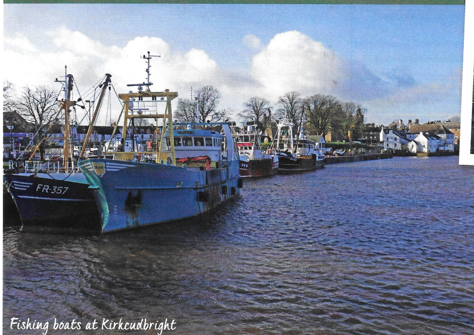
Fishing boats at Kirkcudbright