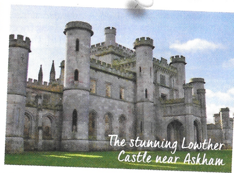
The stunning Lowther Castle near Askham