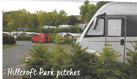
Hillcroft Park pitches

"It is so peaceful here," remarked a fellow camper as we walked through Hillcroft Park on our way down to Pooley Bridge for a swift half, and we had to agree.