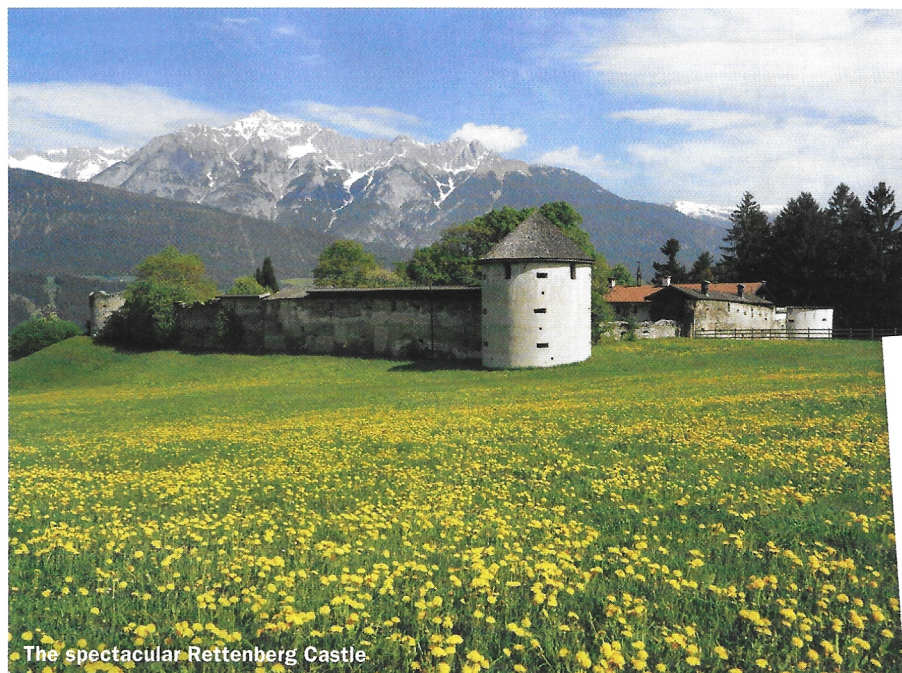
The spectacular Rettenberg Castle