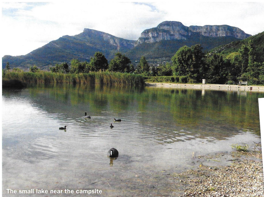
The small lake near the campsite