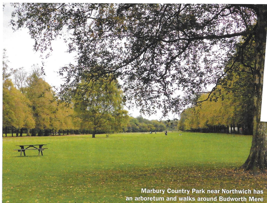
Marbury Country Park near Northwich has an arboretum and walks around Budworth Mere