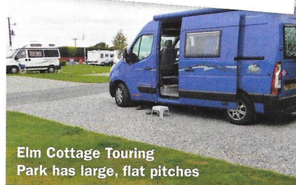
Elm Cottage Touring Park has large, flat pitches