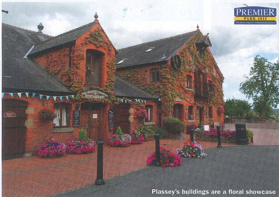
Plassey's buildings are a floral showcase