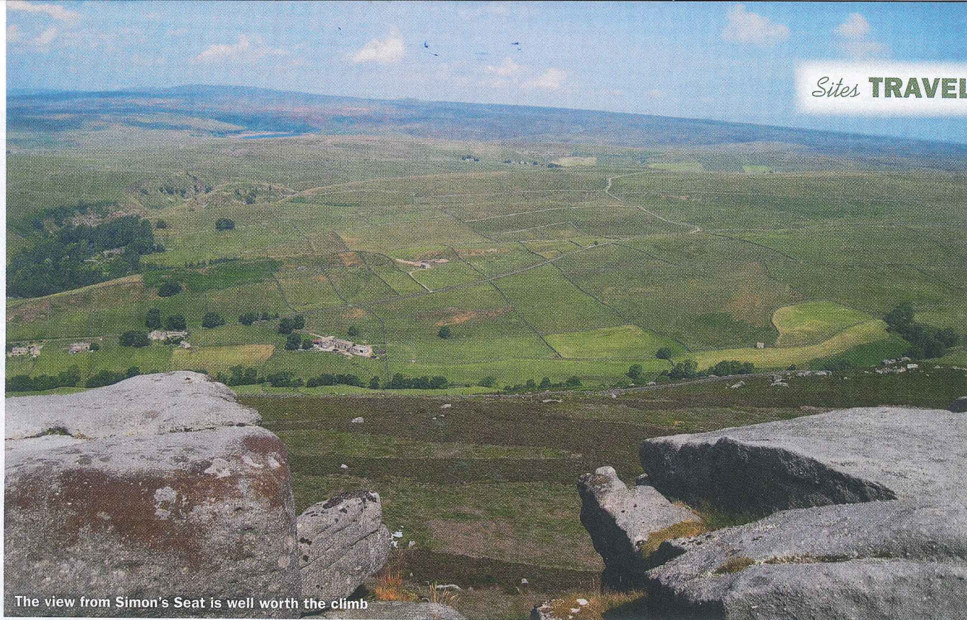
The view from Simon's Seat is well worth the climb